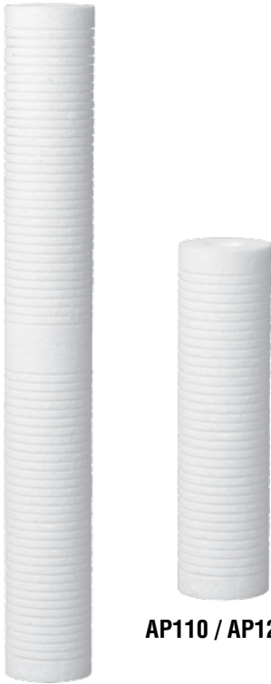
AP110 / AP124